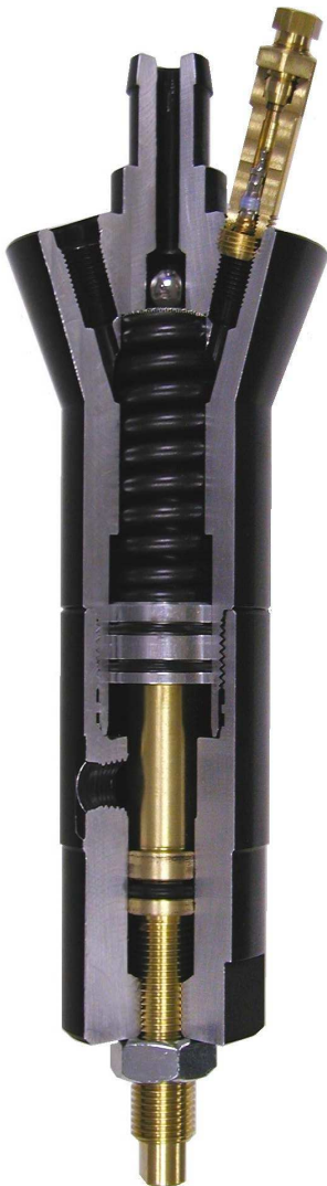
Cutaway view of LubeMinder pump showing internal components

COMBINES: The pump may be cycled off the cylinder that actuates the unloader auger boom. The hydraulic hose assembly should be connected to the side of the cylinder that returns the boom back to the side of the combine for best results. Another cylinder would be the one that activates the feeder hose.