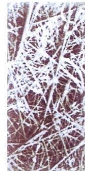
Scanning Electron Micrograph of Coalescing Media @ 500X magnification

Once the aerosol is captured by a fiber, it coalesces with other captured aerosols to form a bulk liquid which is forced by the air flow to the outer surface of the filter media. A non-wicking drain layer attached to the outer surface of the filter media separates the oil and water liquid from the air flow and drains the liquid via gravity to the sump of the filter housing preventing entrainment.