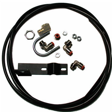
Basic Installation Kit