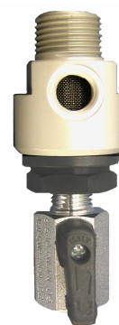
Self-Cleaning Strainer With Ball Valve