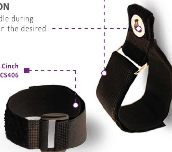
Standard Duty Cinch P/N CS406