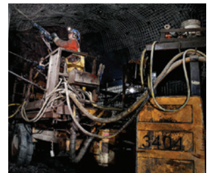
Approved for use in mining applications. MSHA IC-289