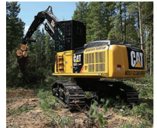
Forestry equipment utilizes 40 HDA where extreme abrasive conditions cause catastrophic hose failure.