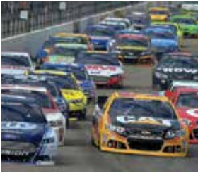
Protect wires from extreme engine temps