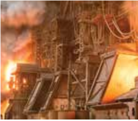
Flame & molten metal splash protection